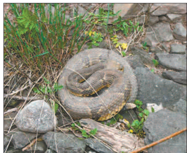
SOME lunchtime patrons visiting Bittner's General Store on Route 14 in Trout Run on May 23 were fortunate to see a rare wild sight — a timber rattlesnake basking in the sun. The adult snake stayed coiled in a ball, hissing at onlookers while rattling its tail. The photographer was able to get close to the snake, a couple feet away, as a 3-foot high cement median blocked his legs at the back end of the parking lot abutting the woods.

land managing agencies to experience everything the great outdoors has to offer. Since 1993, National Trails Day has inspired thousands of people and community groups to take part in activities that promote healthy living, protect green space, educate youth and adults on the importance of trails, and instill excitement for the outdoors. Plan now to host or attend an event in your area. Events in Pennsylvania are listed at www.americanhiking.org/NTD-SearchResult.aspx?sId=38 . They include a trail cleanup in Union County, organized by Boy Scout Troop 525 of Mifflinburg.